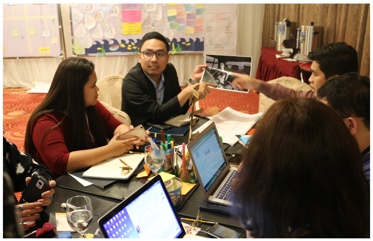
AFS volunteers and staff working through the steps of D.I.V.E. during an intercultural training workshop

she broke it by accident while she was cleaning? Or maybe the most mom was worried about her, thought that she is at risk and wanted to make sure that all was fine? Getting the student to think about multiple interpretations will help her shift her frame of reference and suspend judgment.